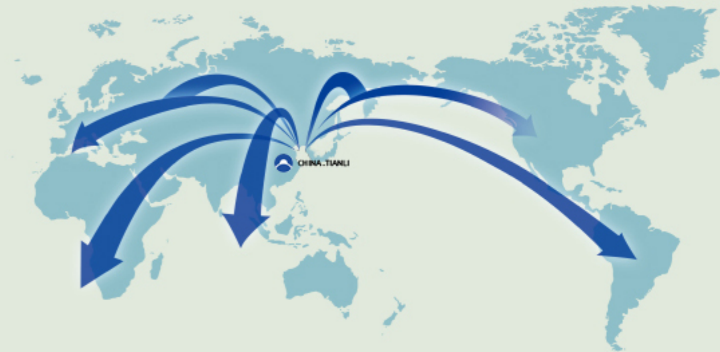
Marketing coverage regions of Tianli's products

China has a huge demand for drying equipment every year, thousands of drying equipment or complete sets of equipment are needed for chemical, petrochemical, power generation, metallurgy, building material, environmental protection, pharmaceutical, woods, grain and food industries. It is estimated that there are thousand types of materials to be dried only in chemical and petrochemical industries every year, which demands thousand sets of drying equipment respectively per year and can realize production value of billions RMB Yuan. Our products have competitive advantage in global market because the technology has reached world advanced level while price is just two third or even half of that of foreign countries. Therefore, we are competitive both in the market of Southeast Asian countries and in that of European and American countries. We have a broad market space for further development.